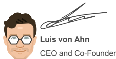
Luis von Ahn