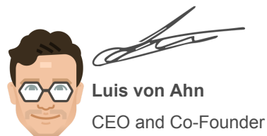
Luis von Ahn